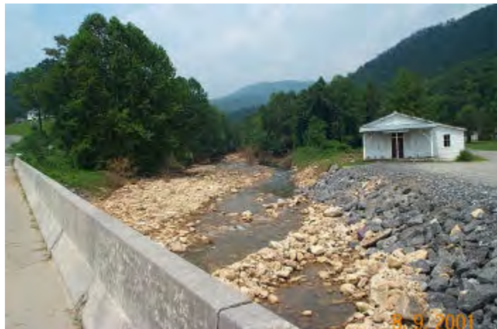
(Rock, Cobble, Sediment)