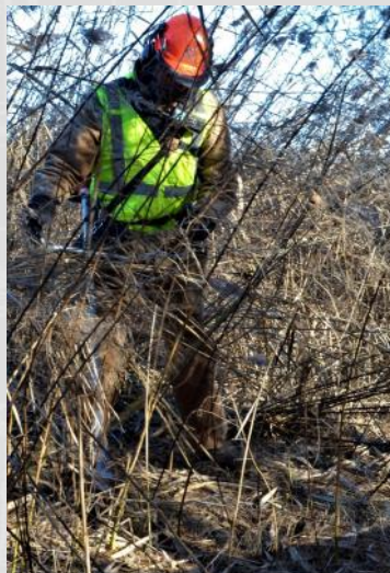
As of: 17 October 2019