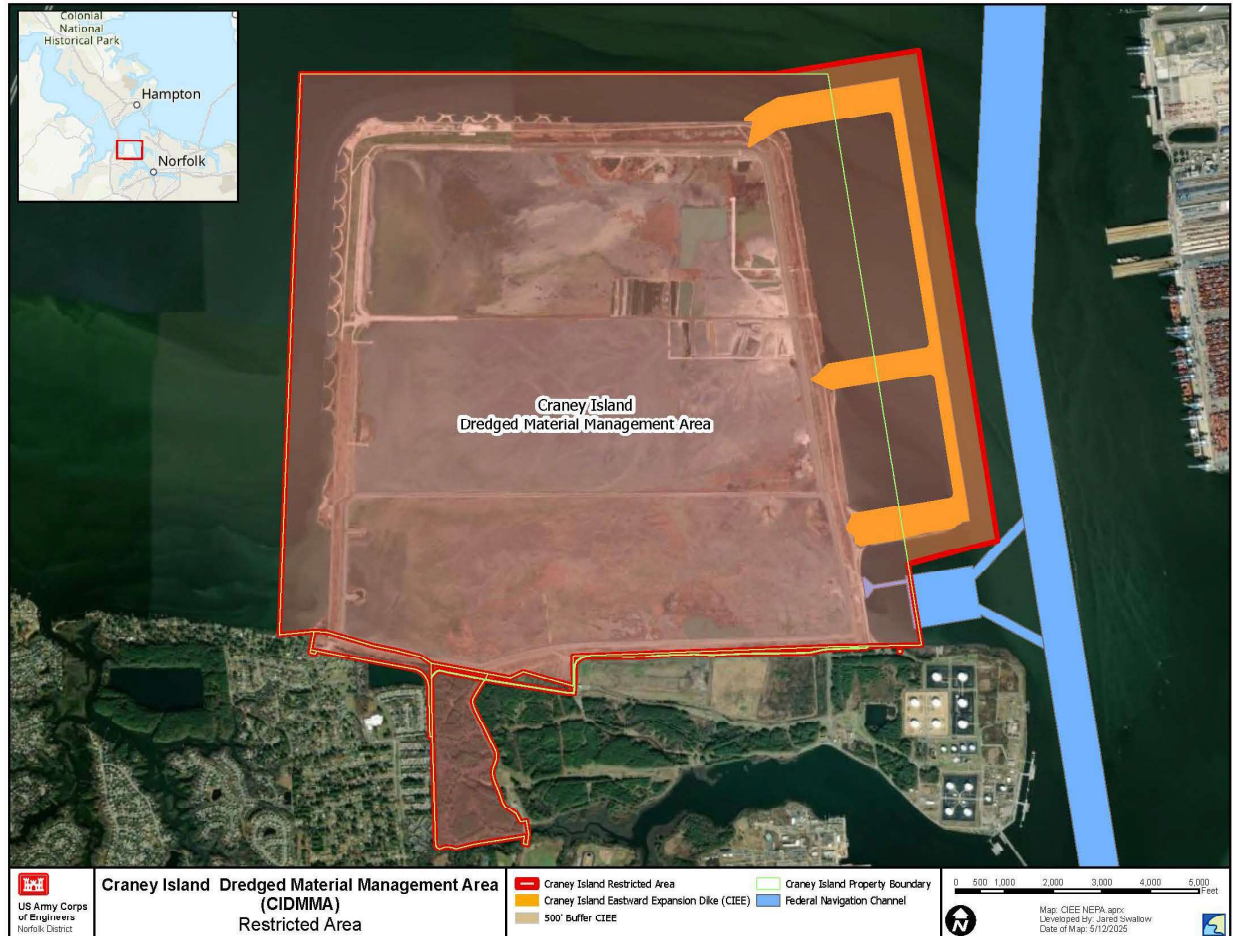
Figure 1.0 - Craney Island Dredged Material Management Area (CIDMMA) Restricted Area

SUBJECT: Norfolk District Policy Restricting Public Access to the Craney Island Dredge Material Management Area