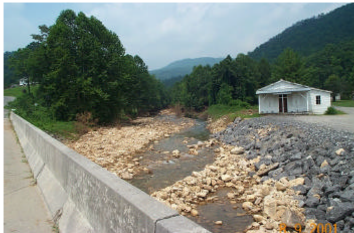
(Rock, Cobble, Sediment)